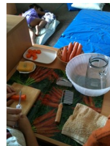
Carrot cutting work

about the solar system. I always look forward to the surprising, sometimes humorous and frequently interesting questions the children when we study this topic. Thank you to the parents that have brought snacks in the past few weeks. Everyone has made an effort to prepare delicious and healthy foods that we have all enjoyed.