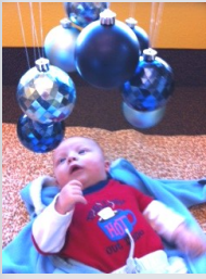
Holidays in the Infant rooms!